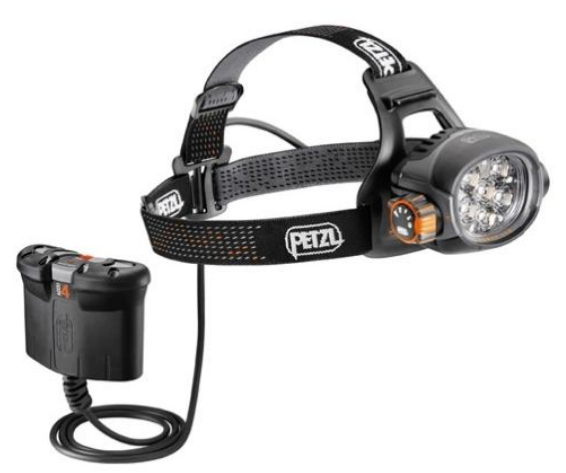
The Petzl Ultra Belt Accu-4

The Petzl is the top dog. It uses power LED's for the light, and a lithium ion battery pack with a smart charger. It has regulated power output, so the lighting stays the sam. It doesn't start bright and slowly dim, it starts super bright and stays constantly bright. It automatically switches to reserve power when the battery is almost discharged. The Petzl has 3 light levels, and this version (the bigger battery "Accu 4") will run for 10 hours in the medium output level. Ski all night if you want to.