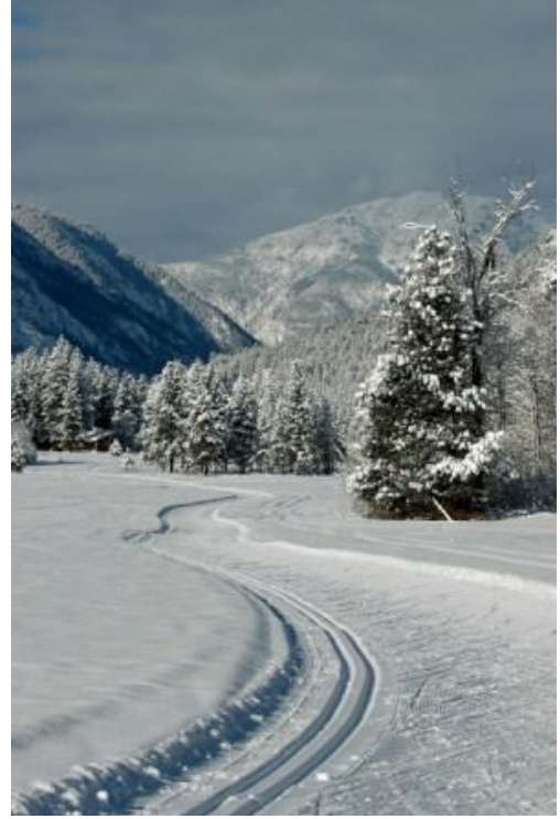
A Methow Valley ski trail.