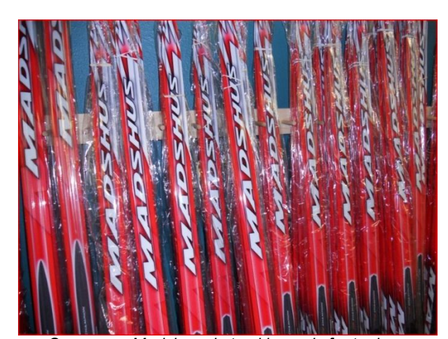
Some new Madshus skate skis ready for tuning.