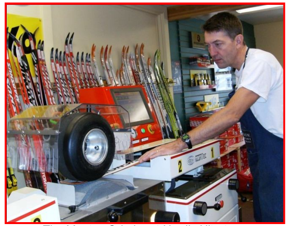
The Mantec Grinder at Nordic Ultratune

Download a <u>workorder form</u>, and send some skis! Spring and summer is a great time to get the skis prepared for the coming season. ■