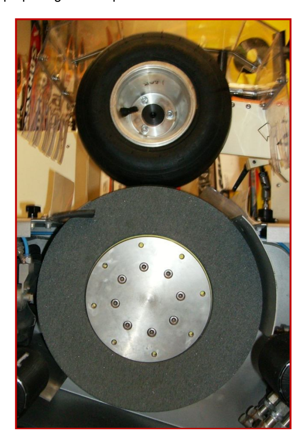
The stone & drive wheel on the Mantec Grinder

In addition, you can choose the base structure that you need – whether it's an all-around structure for your one-and-only pair of skis, or a special purpose grind for specific snow conditions.