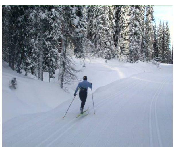
Easy distance skiing at Silver Star in Canada

To avoid missing any ski days at all, you can send your skis before the snow flies, but that would be too easy, wouldn't it? ■